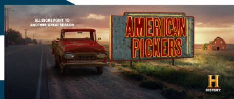
AMERICAN PICKERS is produced by Cineflix Productions for The History Channel. New episodes air Mondays 8pm-9pm ET on History.

americanpickers@cinelfix.com or call 855-OLD-RUST. facebook: @GotAPick